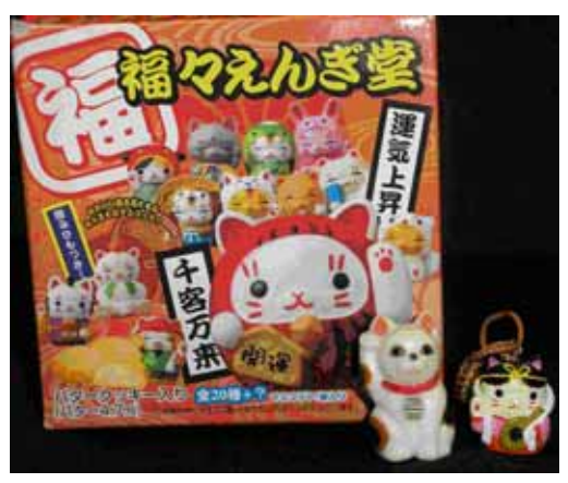
Figure 3. The Beckoning Cat and The Beckoning Cat doing costume play as Benzaiten

from Japanese folklore and religious history. The Beckoning Cat is outfitted as a kappa, Daruma (a round figurine of Bodhidharma), a badger, a fox, a frog, or one of the Seven Lucky Gods ( shichifukujin ), an eclectic group of seven deities who travel together on a treasure ship dis-