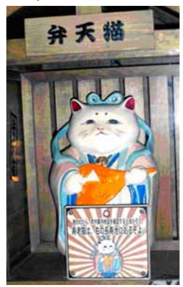
Figure 5. Cat Benzaiten at Namco Namja Town