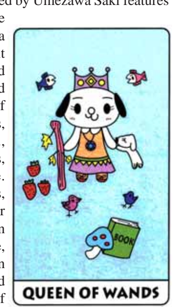
Figure 2. Zoomorphic Tarot Queen of Wands

An interesting trend in Japan is the creation of new tarot decks, which feature animals who take the place of the humans in scenes of the Major Arcana, cards intended to symbolize universal themes in the human experience. In place of people, we find animals in the roles of Magician, Hermit, High