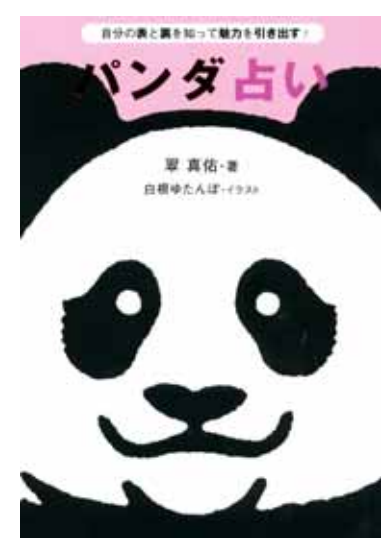
Figure 1. Panda Divination

Priestess, Hanged Man, and so on. For example, the tarot set created by Bi Anjeri and illustrated by Umezawa Saki features