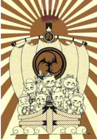
Figure 4. Namco Namja Town Seven Lucky Gods

pensing happiness. 21 In one manifestation, the Beckoning Cat does kosupure (costume play) as the goddess Benzaiten. Thus we find the convoluted image of a Beckoning Cat dressed as goddess who is in turn a Japanese version of the Hindu deity Saraswatî (figure 3).