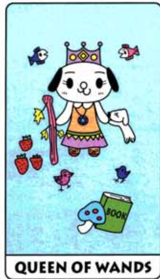
Figure 2. Zoomorphic Tarot Queen of Wands

An interesting trend in Japan is the creation of new tarot decks, which feature animals who take the place of the humans in scenes of the Major Arcana, cards intended to symbolize universal themes in the human experience. In place of people, we find animals in the roles of Magician, Hermit, High