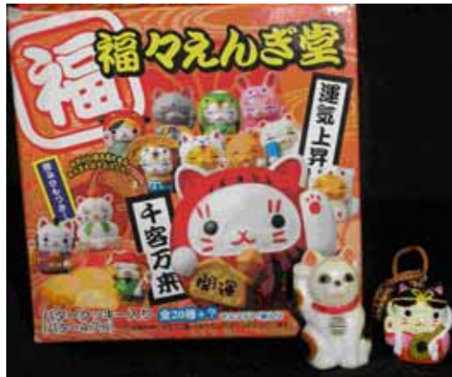
Figure 3. The Beckoning Cat and The Beckoning Cat doing costume play as Benzaiten

The Kabaya Food Corporation uses the Beckoning Cat, or maneki neko , as a theme for a line of crackers sold together with tiny cell phone straps. Maneki neko , a cat figurine with its paw raised as if welcoming one forward, is popular as a good luck charm and is commonly found at the entrance to shops. (The Beckoning Cat figure is said to have originated in the late Edo period, but actual evidence points to a more recent, Meiji invention.) In the cookie company's schema, consumers may buy maneki neko dressed up as different beings from Japanese folklore and religious history. The Beckoning Cat is outfitted as a kappa , Daruma (a round figurine of Bodhidharma), a badger, a fox, a frog, or one of the Seven Lucky Gods ( shichifukujin ), an eclectic group of seven deities who travel together on a treasure ship dis-