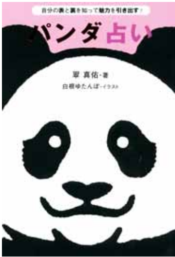
Figure 1. Panda Divination

Priestess, Hanged Man, and so on. For example, the tarot set created by Bi Anjeri and illustrated by Umezawa Saki features puppies on all the cards (figure 2). 19 The Empress card shows a floating doggie wearing a light purple dress and a pink crown, and holding a pentagram-adorned wand, while the Queen of Pentacles is a dog wearing glasses, crowned with a purple tiara, clothed in a red and purple dress, and holding a yellow pentacle. Another new tarot deck uses cats, bunnies, alligators, and other animals. 20 The Empress is a brown bunny who is wearing a red cape, while the Emperor is a stern looking, enrobed cat who is seated on a throne. The device of substituting animals for the medieval European people who are