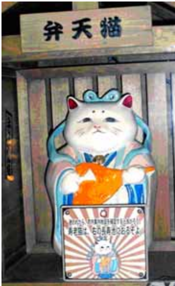
Figure 5. Cat Benzaiten at Namco Namja Town

The game company Namco opened an indoor entertainment theme park in Ikebukuro named Namco Namja Town, and created a stable of cat mascot characters who are found throughout the complex and who adorn promotional goods. Namco also adopted the concept of the Seven Lucky Gods in feline form and often displays images of them on souvenirs, posters, and advertising (figure 4). Within the theme park there are also several statues of Benzaiten as a cat (figure 5).