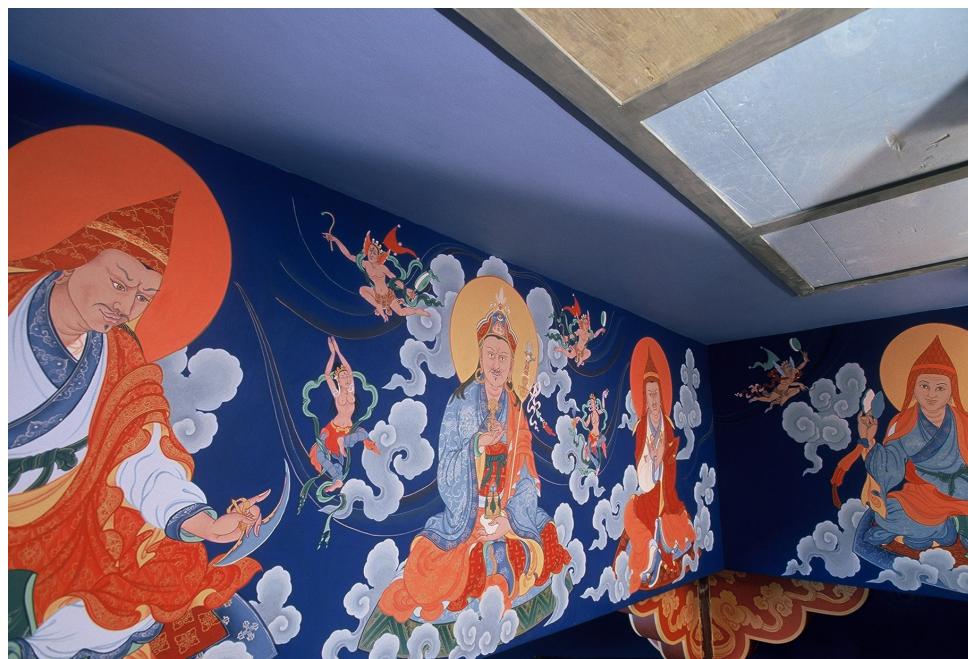
Figure 13. Padmasambhāva (second from the right) and the eight great Indian vidyādhara s. Detail of paintings on the ceiling beam in the interior third level shrine.

Several other sources indicate that the Cakrasaṃvara Sādhana was an important practice in Trungpa Rinpoche's life. According to Dilgo Khyentse Rinpoche, a meditation master who guided Trungpa Rinpoche's students after his death, Trungpa Rinpoche achieved "awakening" on his progressive path through the meditation practice of Cakrasaṃvara. 49