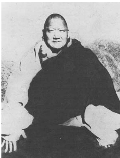
Figure 14. Jamgön Kongtrül of Shechen, Trungpa Rinpoche's root teacher.