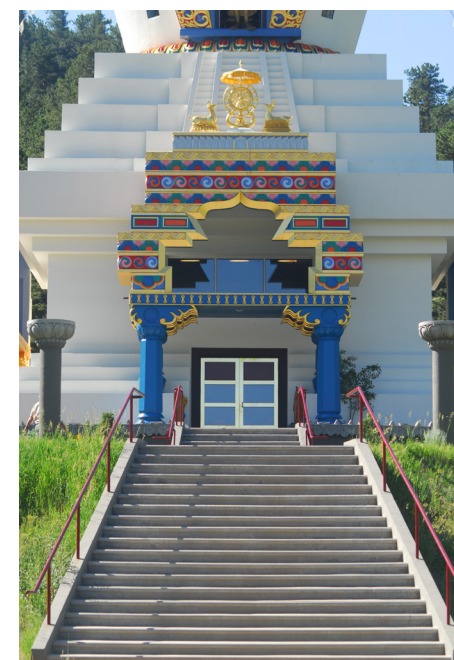
Figure 7. East (main) entrance to The Great Stupa .

the path, although it is believed to be a slow process that can take innumerable lifetimes. Tibetan Buddhism incorporates Vajrayāna practices as skillful means that allow the practitioner to take a more expedient course of action, ideally allowing awakening to occur in one lifetime.