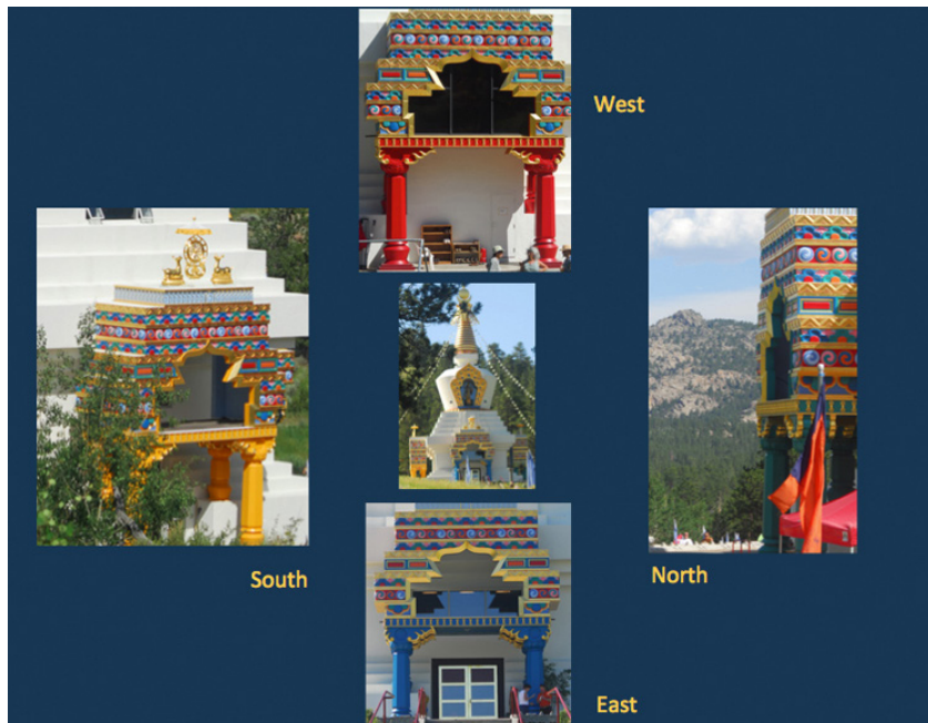
Figure 4. The four gateways and entrances to The Great Stupa .

Although The Great Stupa shares visual and functional features with other Tibetan stūpas , like all sacred architecture it is a product of its time and place. 8 For example, The Great Stupa 's architectural form was constructed with a high capacity concrete intended to