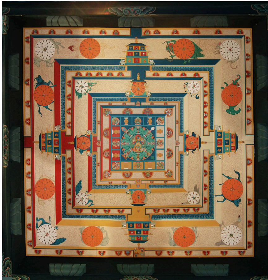
Figure 16. Kālacakra (Wheel of Time) Maṇḍala. Ceiling of the first level interior shrine room.

At a time when powerful monastic leaders refused to transmit teachings outside their lineage, thereby placing many teachings and practices at risk of being lost, three renowned masters—Jamgön Kongtrül Lodrö Tayé (Jamgön Kongtrül the Great) of the Kagyü lineage (1813-1899), Jamyang Khyentse Wangpo of the Sakya lineage (1820–1892), and