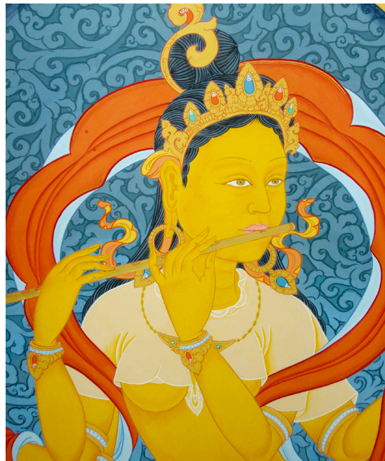
Figure 11. Offering goddess of the Cakrasaṃvara Maṇḍala. Painting detail located in The Great Stupa ’s interior, second level shrine room.

level, the second level provides Vajrayāna practitioners with enough space to walk about, meditate, study, and engage in group practice. The twelve-foot sculptures of Cakrasaṃvara and Vajrayoginī occupy the room’s central space (Figure 10). These precisely sculpted meditational figures, or yidam ( yi dam ), stand in close embrace, symbolizing the inseparable