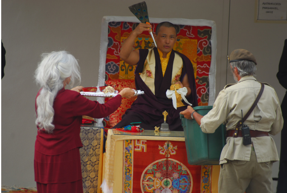
Figure 3. Sakyong Mipham Rinpoche, the current main lineage holder of Shambhala, at the third and final stūpa consecration ceremony. Photograph by Janice M. Glowski, 2006.

visual and musical pageantry commonly seen in Tibet. 7 Finally, in a manner similar to that of traditional Tibetan Buddhist communities, Shambhala (and other Buddhist) practitioners have made the structure a locus of practice. Circumambulation (the clockwise move-