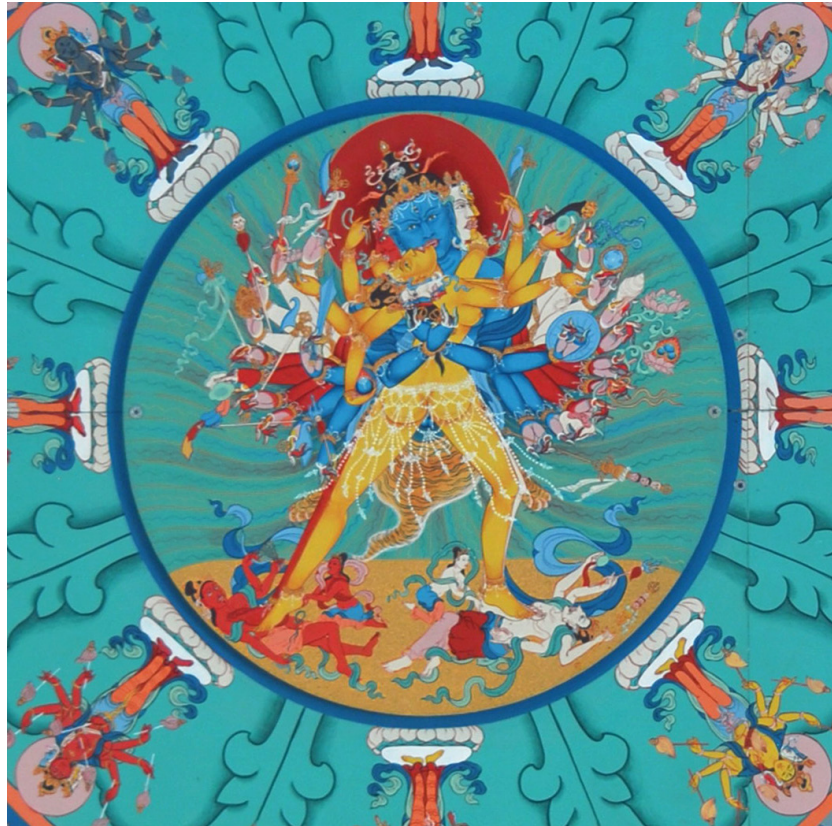
Figure 17. Detail of Kālacakra and Vishvamata at the center of the Kālacakra Maṇḍala.

ings and practices (Figure 15). Indeed, his training took place in ri-me milieus. It is not surprising, then, that ri-me attitudes permeate The Great Stupa ’s practice environments. Vajrayāna students of any lineage affiliation