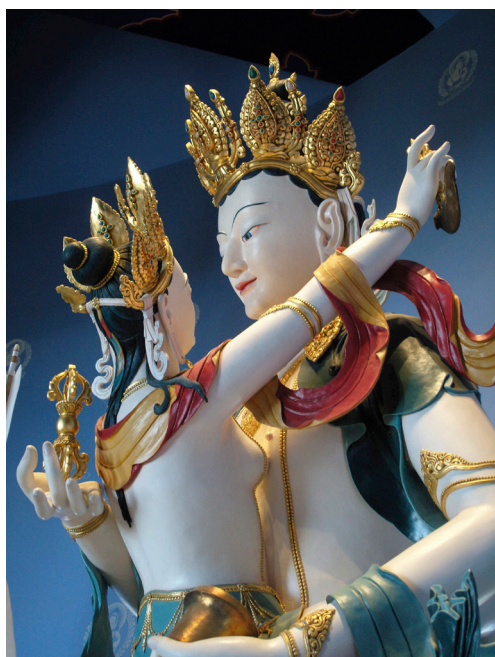
Figure 12. Detail of the Vajrasattva and Vajrātopā sculpture on the interior third level.

union of the masculine and feminine principles: upāya (skillful means) and prajñā (best knowledge or knowing), or karuṇā (compassion) and śūnyatā (wisdom or emptiness). The experience of their inseparable nature is sometimes translated as luminosity-emptiness. Detailed paintings of offering goddesses and other key maṇḍala elements visualized during the practice of the Cakrasaṃvara Sādhana cover the room's walls and ceiling (Figure 11). Cakrasaṃvara symbolism at the stūpa also extends beyond the second interior level. The four large, colored gateways on The Great Stupa 's exterior signify entrances into a Cakrasaṃvara palace. 47 The symbolic overlay of maṇḍalas and stūpa architecture can be traced to Buddhist art's early history. 48 In the case