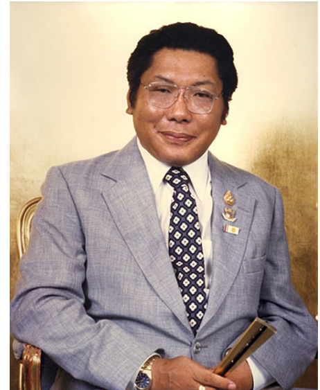
Figure 2. Chögyam Trungpa.

The Great Stupa further maintains ritual and practice continuities with traditional Tibetan stūpa architecture. First, the monument contains the relics of a recognized teacher. In this case, Chögyam Trungpa's skull-relic is encased inside a large Buddha image located in the monument's interior first level. Second, like other Tibetan stūpas , the relic was ritually installed and consecrated by qualified Tibetan lamas. In August 2001, Tibetan meditation masters and other monastics donned regalia and conducted traditional rituals and ceremonies over several days to empower the structure (Figure 3). Shambhala's current lineage holder, Sakyong Mipham Rinpoche, installed the relic while throngs of Shambhala practitioners, honored Tibetan visitors, and curious others watched the delegates engage in