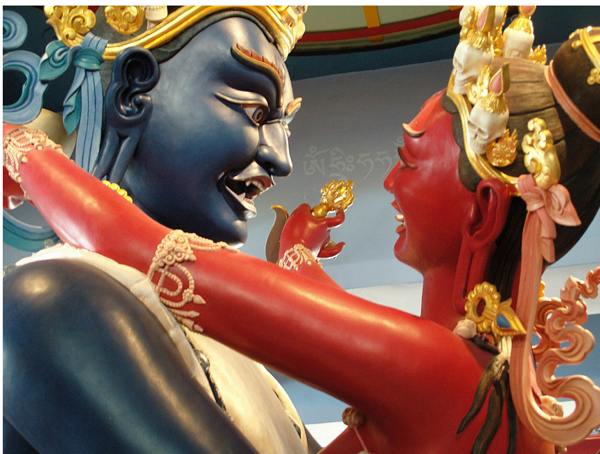
Figure 10. Cakrasaṃvara and Vajrayoginī. Detail of the main sculptures on the interior second level.