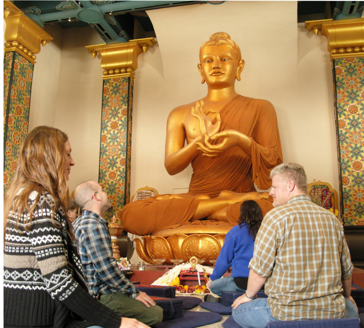
Figure 8. Śākyamuni Buddha making a teaching gesture ( dharmacakramudrā ).

all Tibetan Buddhist practitioners choose to enter into the practices of this yāna . To access the stūpa 's Vajrayāna shrines, one first enters the main entrance on the monument's east side (Figure 7). Large glass doors with copper trim open into a spacious, publically accessible first floor, which houses meditation cushions and a small table for offerings of