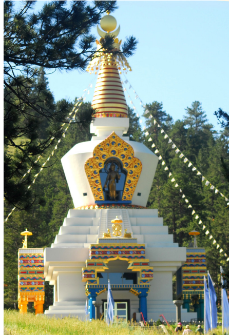
Figure 1. The Great Stupa of Dharmakaya Which Liberates Upon Seeing . Photograph by Janice M. Glowski, 2006.

United States alone is home to more than thirty Tibetan Buddhist stūpas , and the numbers continue to grow.