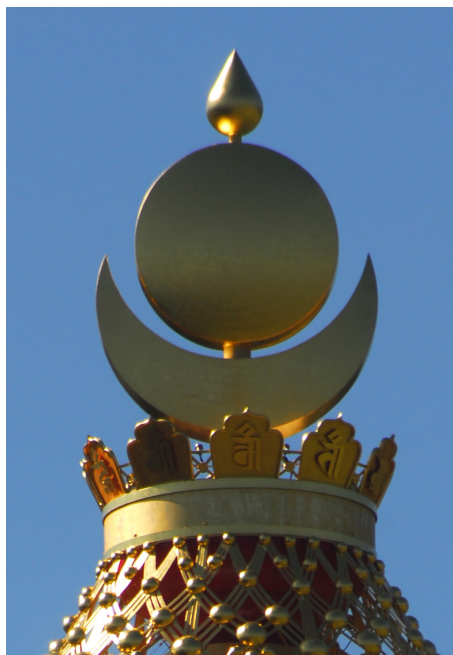
Figure 6. The moon, sun, and jewel surmounting The Great Stupa 's spire. Photograph by Janice M. Glowski, 2006.

The upper three golden discs on the stūpa 's spire symbolize attainments of the bodhisattva and are sometimes associated with Vajrayāna practice. Stūpas that represent only the Hīnayāna-Mahāyāna path of practice tend to include just the first ten bhūmis . Trungpa Rinpoche trained in the three- yāna system; thus, it is logical that The Great Stupa includes the additional three discs. A golden parasol, moon, sun, and, finally, a jewel surmount the spire of gold discs (Figure 6). The parasol indicates unconditioned compassion, while the sun and moon represent the inseparable union of wisdom and compassion, respectively. The jewel symbolizes complete enlightenment. Thus, when read from bottom to top, the monument's exterior forms communicate the three- yāna path to enlightenment. Like Trungpa Rinpoche's meditation path, the Hīnayāna serves as the foundational component, with an expansion into the Mahāyāna path of the bodhisattva . The stūpa 's visual biography clarifies the value Tibetans place on the Hīnayāna and Mahāyāna trainings. Tibetans widely accept that enlightenment can be attained through the Hīnayāna and Mahāyāna aspects of