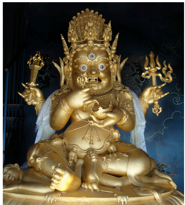
Figure 9. Four-Armed Mahākāla (Great Black One) located in The Great Stupa 's stairwell.

Vajrayāna practices were central to Trungpa Rinpoche's training. According to his autobiography, despite the upheavals in Tibet and growing pressures by the Chinese, Trungpa Rinpoche was able to complete the rigorous ngöndro ( sngon 'gro ), or preparatory training, typically undertaken before Tibetan Buddhists enter into the Vajrayāna. He describes his ngöndro as including 100,000 full-body prostrations, 100,000 recitations of the Triple Refuge, 100,000 mantra recitations (likely the Vajrasattva mantra ), 100,000 maṇḍala offerings, and 100,000 guru yoga recitations. 39 As with the Hīnayāna and Mahāyāna stages on the path, a vow formally marks one's entry into the Vajrayāna. The samāya , or Vajrayāna, vow indicates a complete and unbreakable commitment between a guru and the disciple, until enlightenment occurs. By becoming vow-bound with a