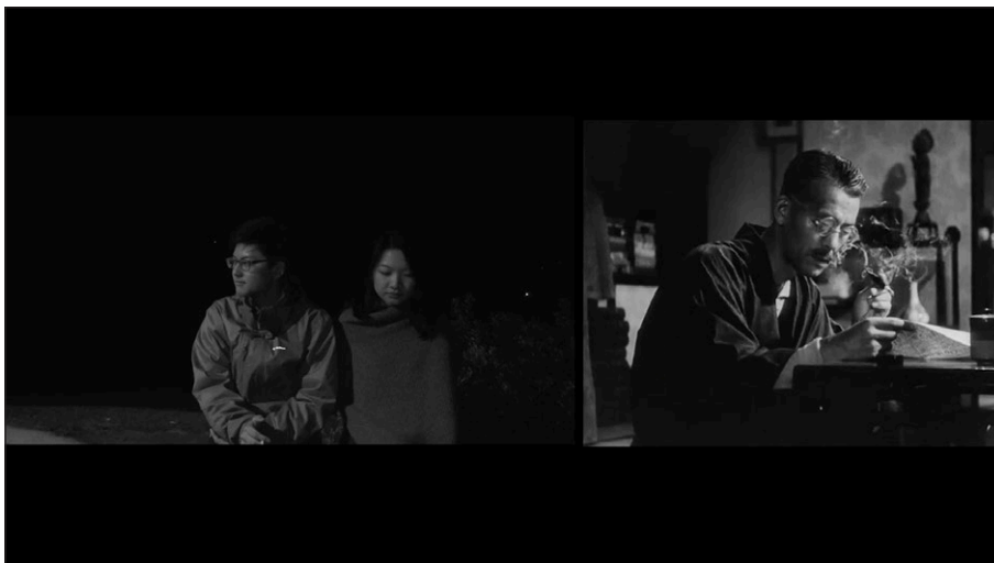
Clip 9: Autumn Leaves (2014), dirs. Amanda Benoliel, Rita Lin, Minyang Liu, and Ruoyi Wu – minimal lighting (film clip); Late Spring (1949), dir. Ozu Yasujirō – minimal lighting (film clip). Reproduced with permission, all rights reserved. Available for download here: https://doi.org/10.16995/ane.236.s14 .