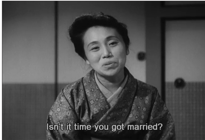
Figure 4: Late Spring (1949), dir. Ozu Yasujirō – direct camera shot.

In conjunction with this assignment, students studied three of Ozu's postwar films: Late Spring ( Banshun , 1949), Early Summer ( Bakushū , 1951), and Tokyo Story ( Tokyo monogatari , 1953). Known as the "Noriko trilogy," the main character in all three films is a young woman in her twenties named Noriko, played by the actress Hara Setsuko (1920–2015). While there is no direct narrative continuity between the films (they are not sequels), all three deal with similar themes concerning the dissolution of the traditional Japanese family—whether through marriage or death—and the fraught relationships these life events create between the older (prewar) and younger (postwar) generations. Additionally, in terms of cinematography and the formal aspects of Ozu's filmmaking style, these three films are extremely similar and create a visual and aesthetic continuity that, once one is familiar with it, is easy to recognize.