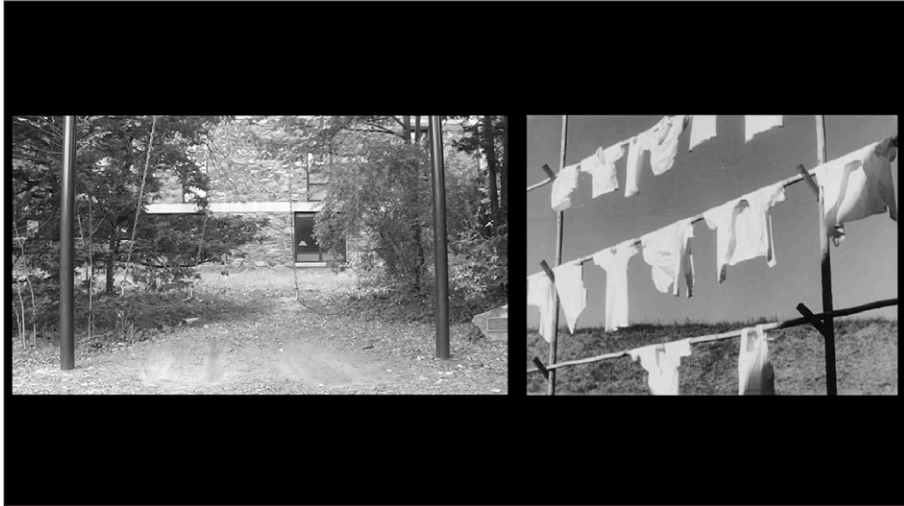
Clip 8: Broken Fall (2014), dirs. Cruz Arroyo, Maho Okumura, and Lauren Pronger – pillow shot (film clip); Tokyo Story (1953), dir. Ozu Yasujirō – pillow shot (film clip). Reproduced with permission, all rights reserved. Available for download here: https://doi.org/10.16995/ane.236.s13 .