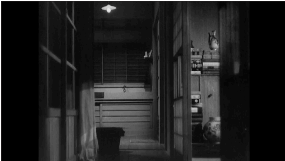
Clip 2: Late Spring (1949), dir. Ozu Yasujirō – static camera. Available for download here: https://doi.org/10.16995/ane.236.s2 .

The precise uniformity and repetition of Ozu's filmmaking style has been described by scholars as technically "remarkable" (Jacoby 2008). As a result, Ozu's films are not only stylistically compelling for students to emulate, but they provide an ideal historical, narrative, and structural framework for this creative assignment.