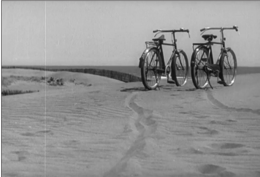
Figure 2: Late Spring (1949), dir. Ozu Yasujirō – pillow shot.