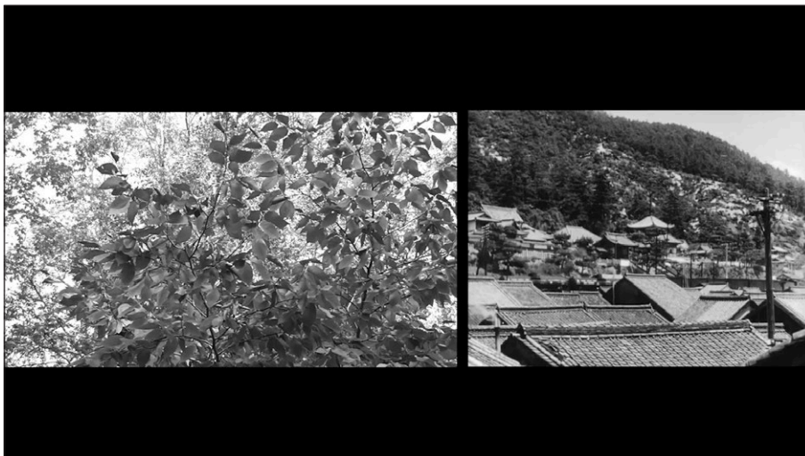
Clip 7: Broken Fall (2014), dirs. Cruz Arroyo, Maho Okumura, and Lauren Pronger – opening sequence; Tokyo Story (1953), dir. Ozu Yasujirō – opening sequence (film clip). Reproduced with permission, all rights reserved. Available for download here: https://doi.org/10.16995/ane.236.s12 .