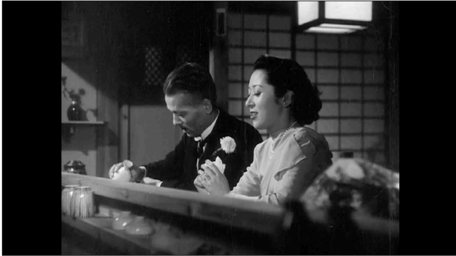
Clip 1: Late Spring (1949), dir. Ozu Yasujirō – 360-degree use of space. Available for download here: https://doi.org/10.16995/ane.236.s1 .