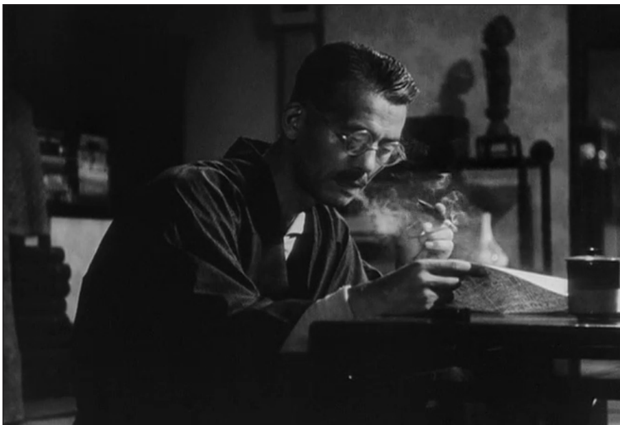
Figure 3: Late Spring (1949), dir. Ozu Yasujirō – minimal lighting.