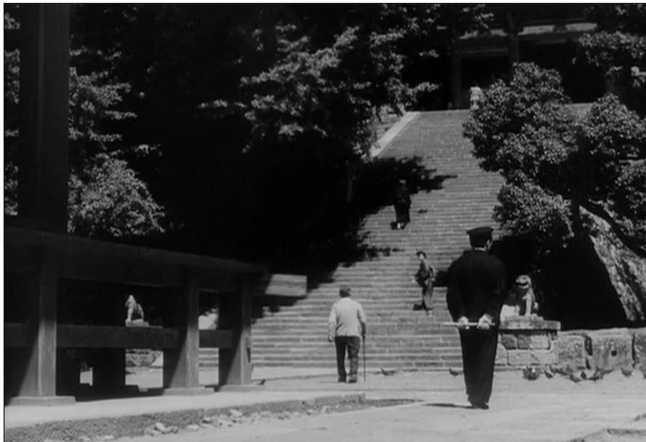
Figure 1: Late Spring (1949), dir. Ozu Yasujirō – low camera angle.

My second reason for choosing Ozu as a model for my students is that his filmmaking style is quite unusual. Film scholar David Bordwell observes, "Ozu's films seem stylistically simple. . . [however] when looked at more closely they emerge as very odd indeed. . . . Put another way, Ozu's style is undeniably unusual, yet his films pose no drastic problems to narrative comprehension" (Bordwell 1988). What Bordwell is referring to here is Ozu's emphasis on the visual and how his elevation of image over text adheres to a specific set of cinematic devices that create an extremely legible visual aesthetic and style. For instance, the formal aspects of Ozu's films are comprised of low camera angles ( Figure 1 ), 360 degree use of space, static camera, "pillow shots" (or empty shots, Figure 2 ), minimal lighting ( Figure 3 ), direct camera shots ( Figure 4 ), and a preference for working in black and white film, to name a few.