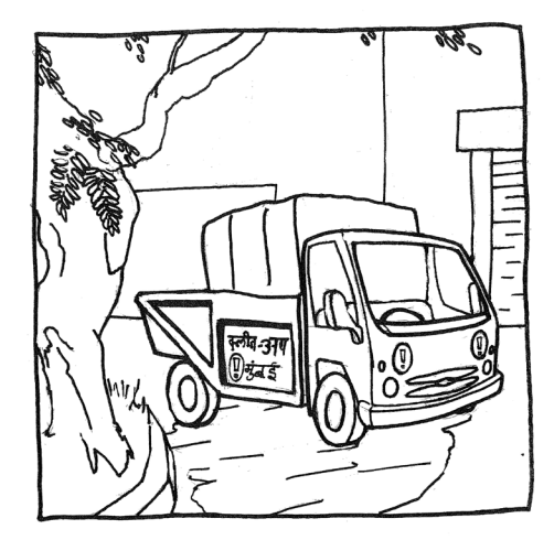
Color in the Trash Truck

In the summer of 2009, I traveled to Mumbai to study the hand-painted political graphics of India. I had many promising questions to pursue: questions about literacy, political participation, and freedom of expression; questions about property rights, political thuggery, and vandalism. I wanted to ask: How important are these forms of visual communication in a country where many are illiterate and many different writing systems are used? Who is empowered to create these acts of political expression? How do the private property rights of the people