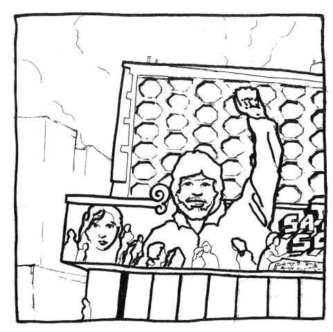
Color in the Bollywood Billboard

I agree with him, though I know that printing isn't the newcomer technology. In fact, I later read a Times of India (another