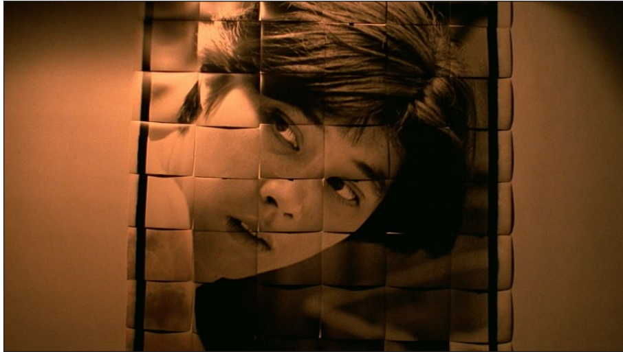
Figure 1: The enlarged, mosaic wall photos of White Chick.

with an idealized image of the opposite sex. In light of her being “half-American,” the collage of White Chick on the wall also implies the fragmentation and illusoriness of the American dream. Unlike Laura Mulvey’s critique of classical Hollywood cinema and the male gaze, The Terrorizers deconstructs the male gaze by showing how the male photographer is consumed by his own gaze and his fantasy of the other sex and White Chick’s exotic whiteness. In other words, the photographer is the one on display, extracted from his voyeuristic, behind-the-camera position and seemingly transfixed and merged into the images of White Chick. He becomes the object of the viewer’s gaze, against which he is utterly defenseless. Yang’s camera reconfigures the power relation between male and female characters through the intricate framing, reframing, and repositioning of the photographer and the object/image of his desire.